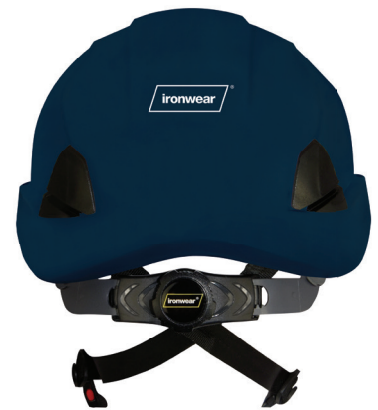
(Back with Ratchet)