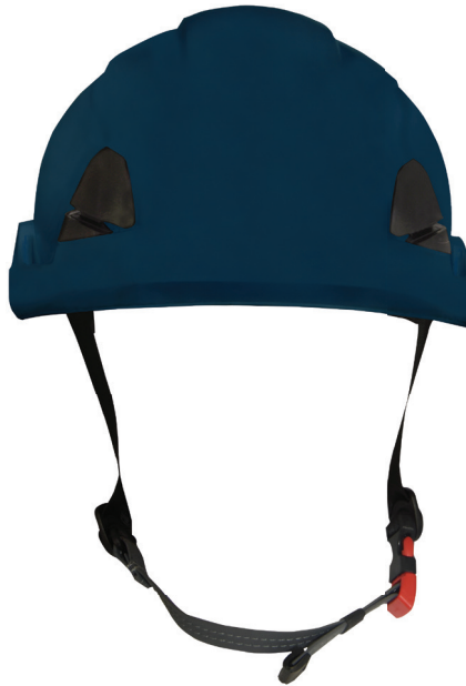
(Front with Chin Strap)